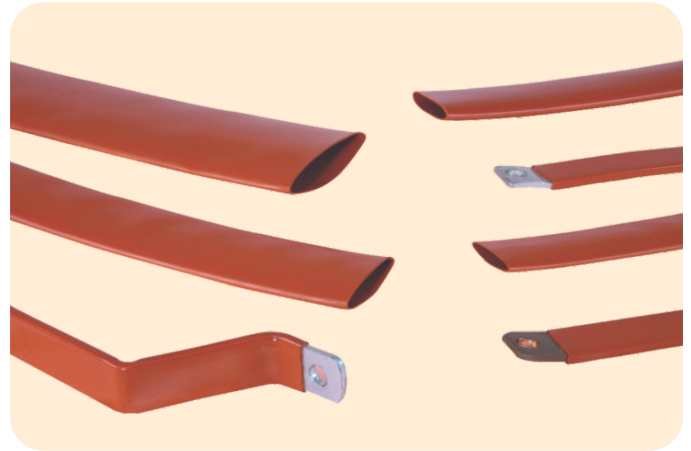
GMB / GHB Series Tube