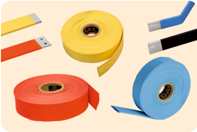
GSC Series Tube